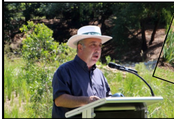
Jack Jacovou, Mayor of Hurstville City Council